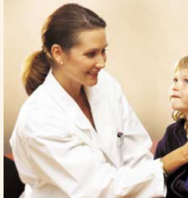
▲ The Echo-Screen module includes an ultra-lightweight probe (4 grams) for screening babies and small children.

The following application modules can be freely combined to suit your individual requirements: Distortion Product OAE, Transient Evoked OAE, Screening Tympanometry, and Echo-Screen™ TEOAE Screening. Both OAE modules include a mode for measurement of Spontaneous OAE's. Echo-Screen is Madsen's handheld OAE screener.